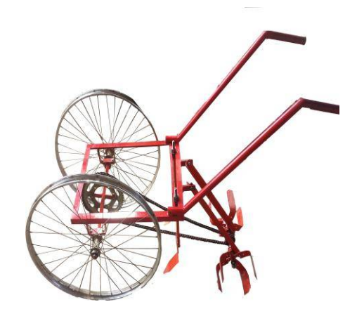
Figure: 1 Double wheel weeder

This model is designed to fulfil the present requirements (shown in fig1) and plate is designed as( shown in table1). The chain sprocket mechanism is used in this model for increasing the speed ratio.